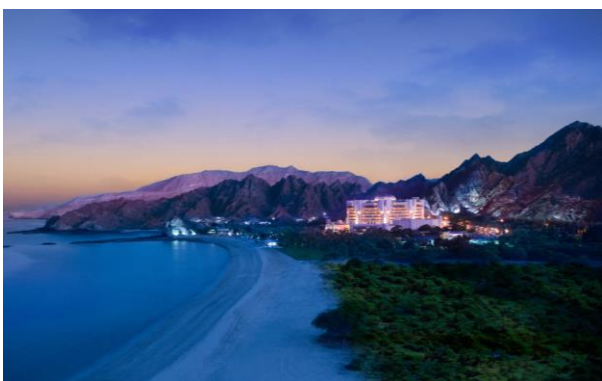
Exterior View of Al Bustan Palace, a Ritz-Carlton Hotel