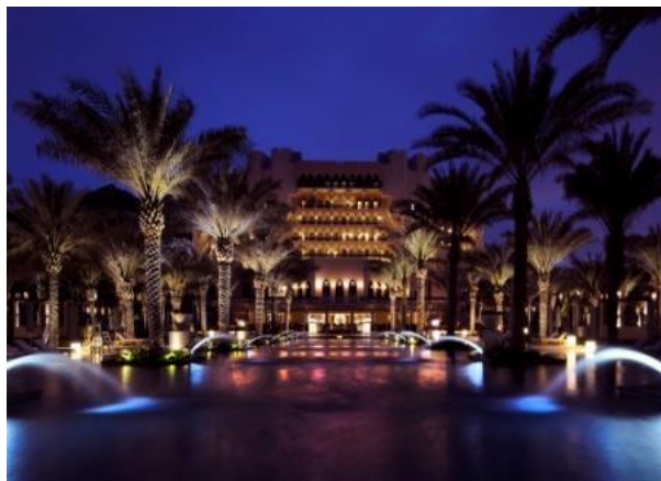
Twilight at Al Bustan Palace, a Ritz-Carlton Hotel