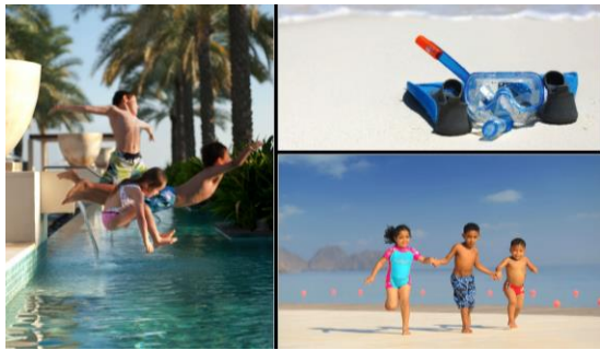
Ritz Kids Activities