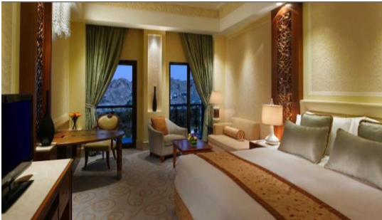
Deluxe Room with Mountain View