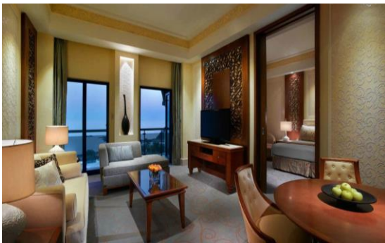
Executive Suite with Sea View