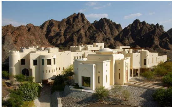
Six Senses Spa at Al Bustan Palace