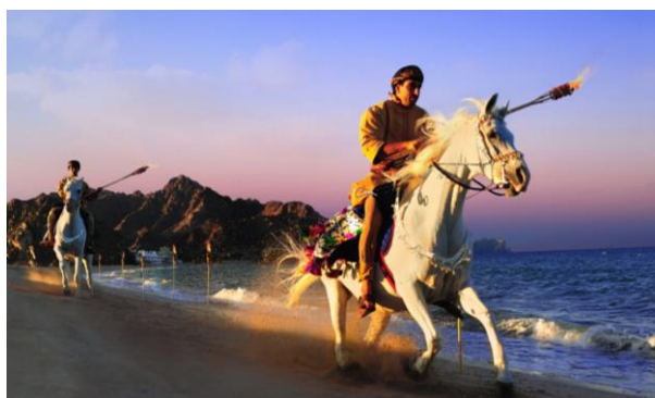
The Magical Scene Surrounding Al Bustan Palace