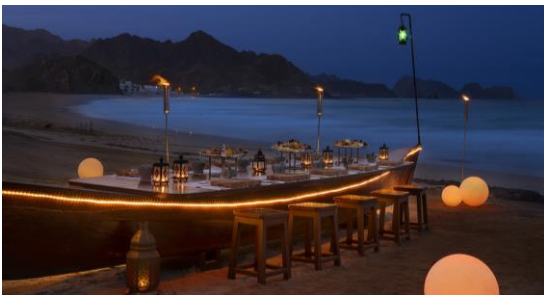
Crab Shack Dinner at Beach Pavilion