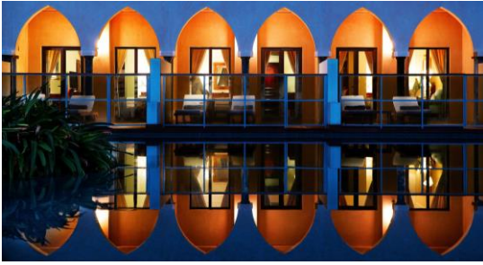
Al Bustan Lagoon Room Deck