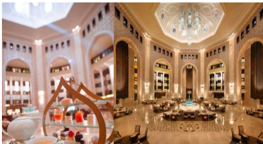
Atrium Lobby Lounge

At Al Bustan Palace, exceptional cuisine combines with the most exquisite views and styles. Diverse choices between the authentic and the modern can be savoured in many different ambiances. The settings include stunning views from terraces overlooking the unique gardens and the sea Oman, or of the unique Palace itself.