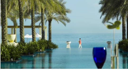
View from Al Khiran Terrace