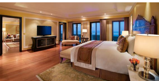
Presidential Suite with Sea View